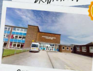
STAY IN SCHOOL