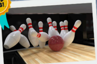
TEN PIN BOWLING & CINEMA